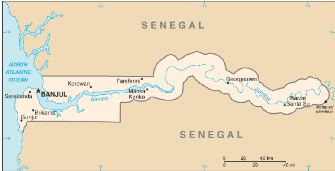
Map 1: CIA (Central Intelligence Agency) (6)