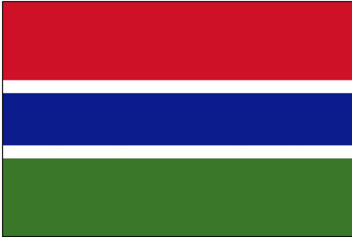
Image 1: The flag of The Gambia.